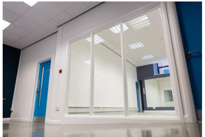
REAR STUDIO – SEFTON SUITE