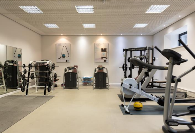
REAR STUDIO – SEFTON STREET