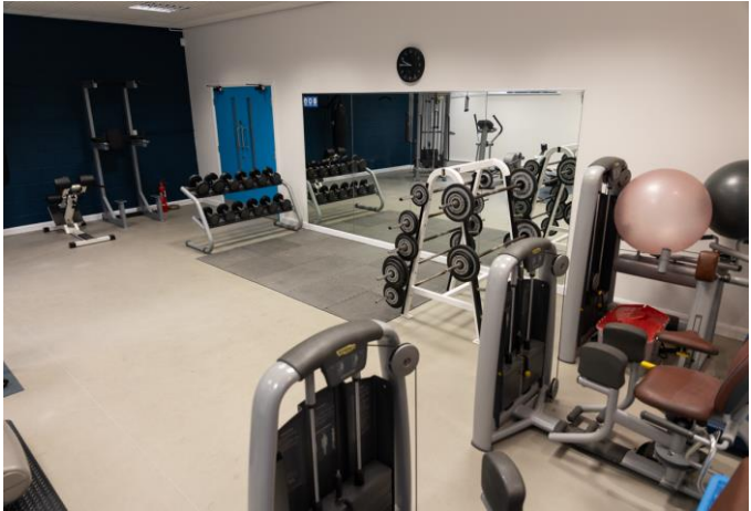
REAR STUDIO- SEFTON STREET