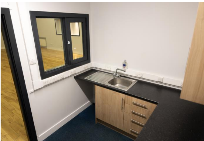
7 PLEASANT HILL STREET