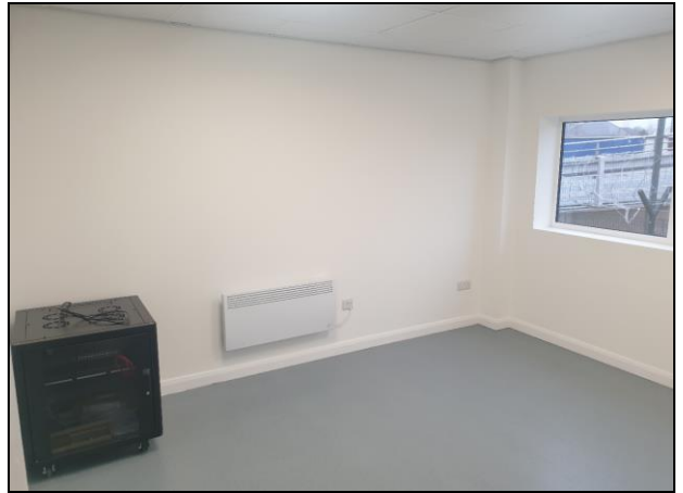
1 ST FLOOR OFFICE